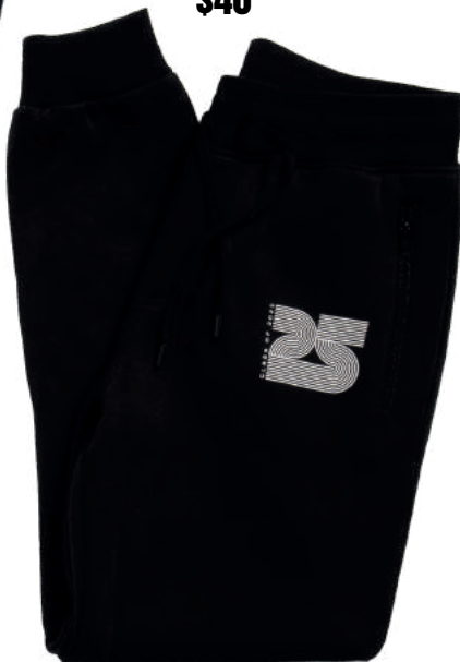
25 Joggers $40