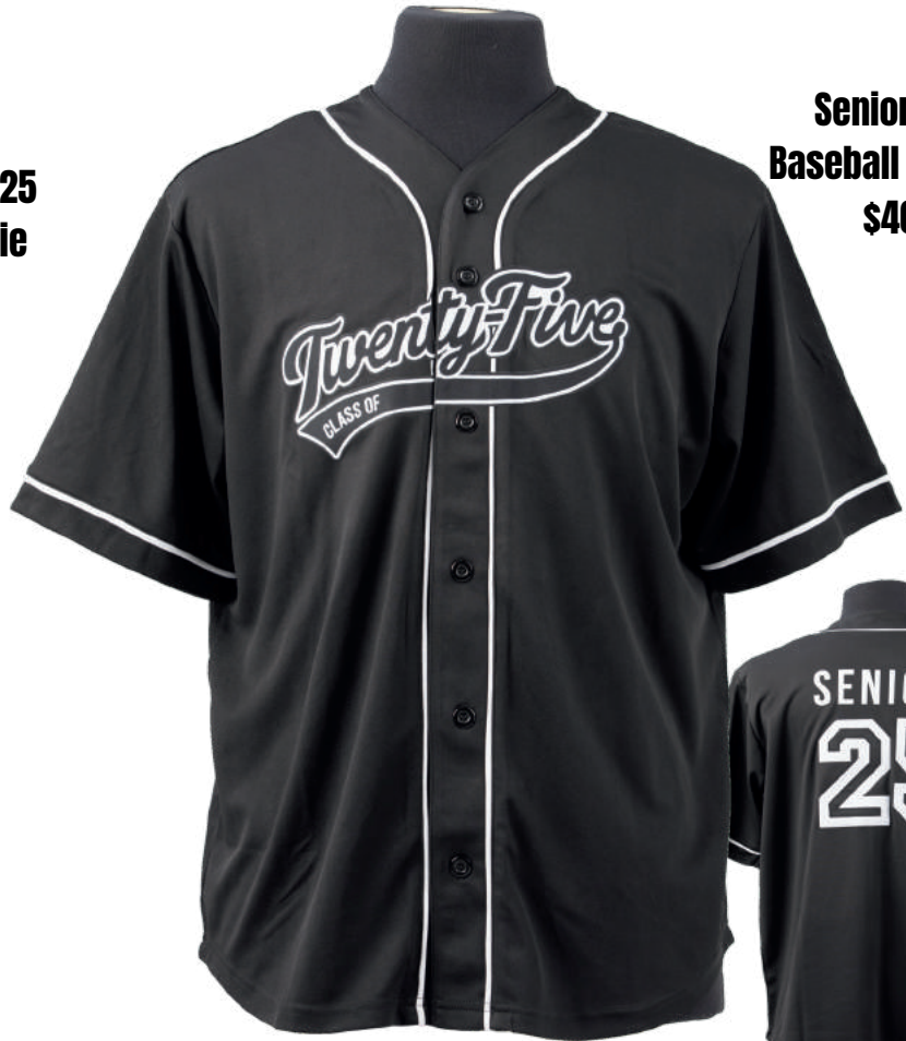
Senior 25 Baseball Jersey $40