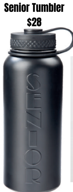
Senior Tumbler $28