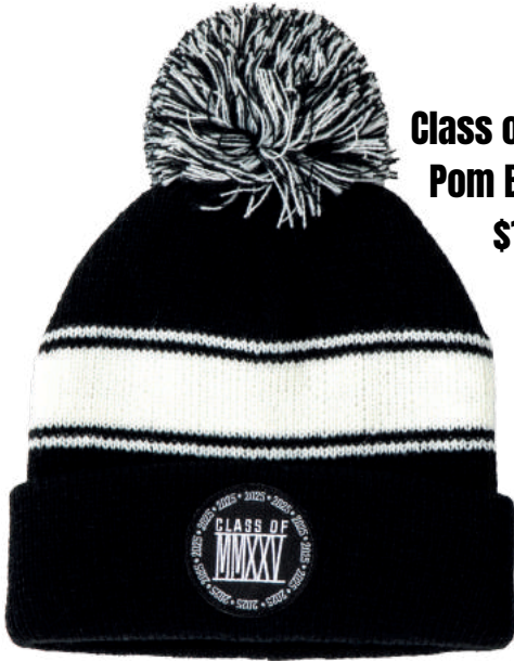
Class of 2025 Pom Beanie $18