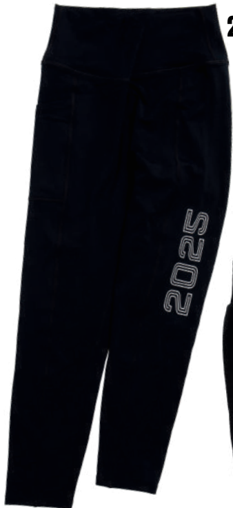
2025 Leggings $20